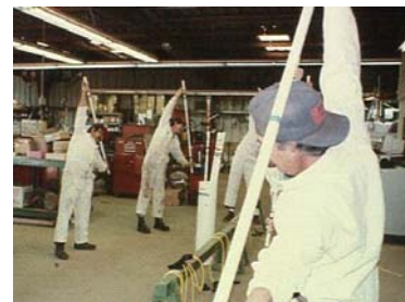
Fitness sticks help reduce injuries to upper extremities and promote interest and participation.