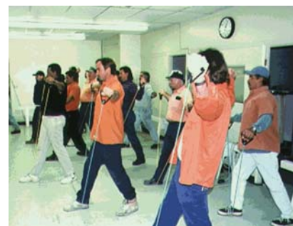
Flex cords increase balance strength to reduce strain injuries and increase participation.